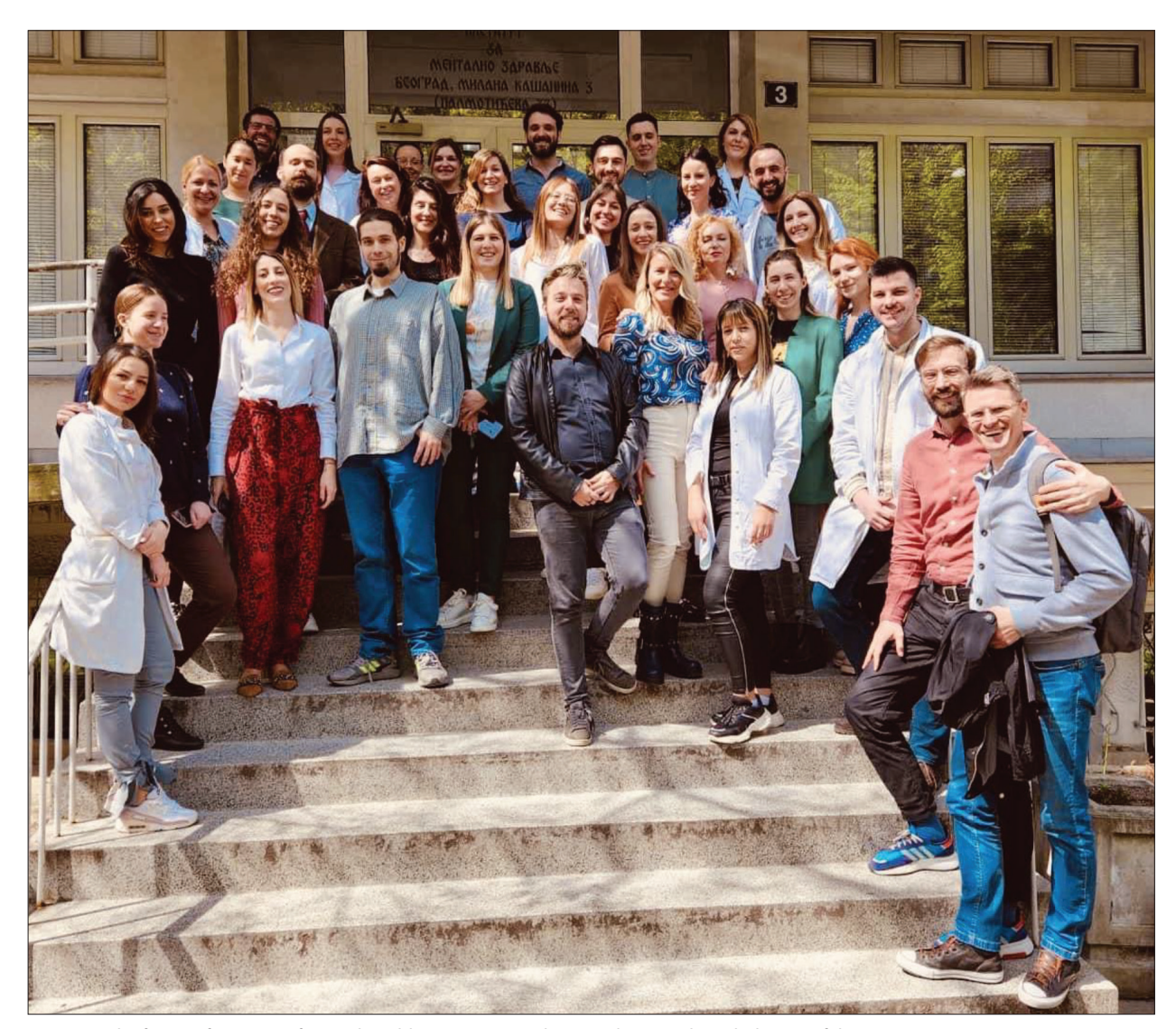
Figure 4. The future of Institute of Mental Health - young specialists, residents, and psychologists of the Institute

epidemiological research at the Institute was continued. In addition to epidemiological, the Institute also conducts other types of research. On average, about 30 research outputs per year are conducted at the Institute, as part of the post-graduate training of academics or larger, multidisciplinary research groups.