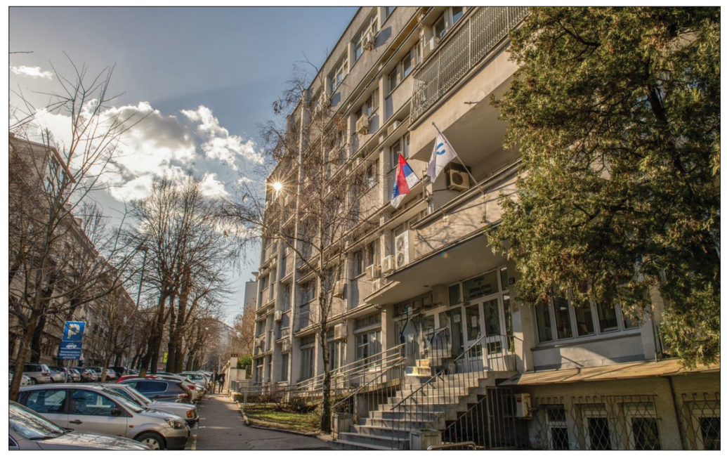
Figure 1. The Institute of Mental Health, 2023

Caring for people with mental health problems in Serbia began more than 160 years ago, with the opening of Doctor's Tower, as